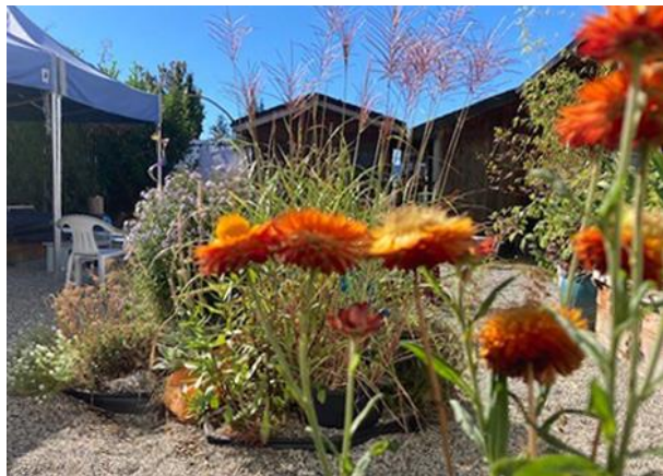
Fall Flowers in the Family Place garden

It's been three years since we officially opened the doors at Sechelt Family Place, and this time has been energetic, joyful, tumultuous, and multifaceted.