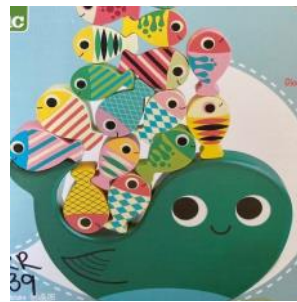
Sock Memory Game 15639