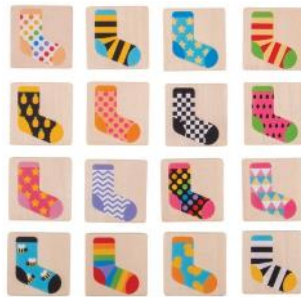
Sock Memory Game 15643