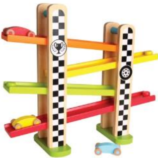
Fast Flip Racetrack 15628

We have many new and exciting additions to our library and we look forward to sharing them with you! These are just a few of the new additions we've made. Come in for a visit. Our shelves are well stocked!